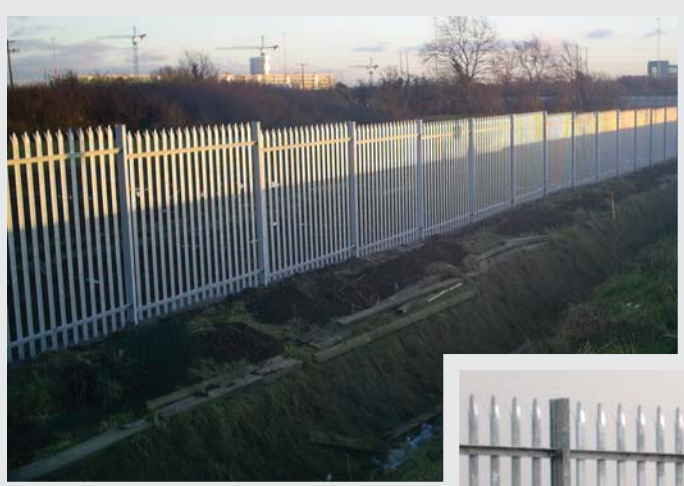
NRA spec palisade fence securely installed on soft uneven ground