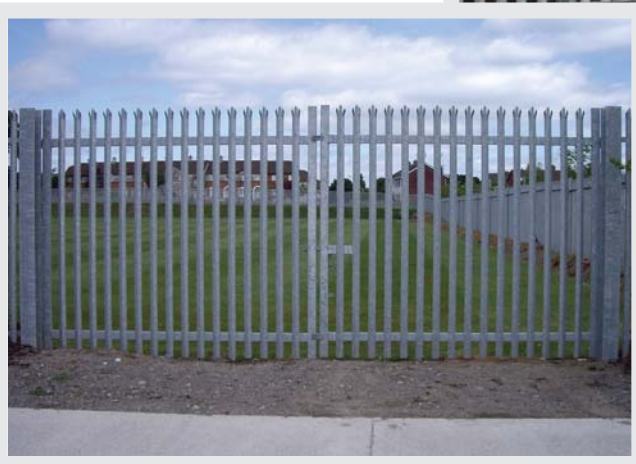
NRA spec palisade gate mounted to high grade galvanized steel posts.